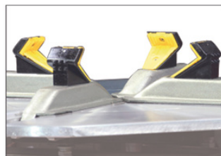
Embedded plastic cover for clamping jaw