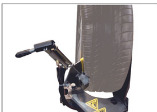
Hand control bead breaker with anti-clamp shovel