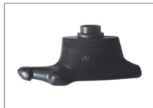
Reinforced nylon demount head as standard