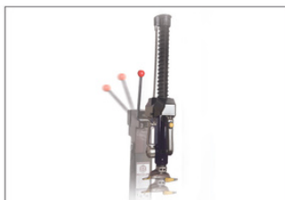
Hand lever turret device