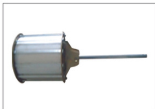
200mm aluminum bead breaker cylinder