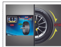
Automatic brake at unbalance point