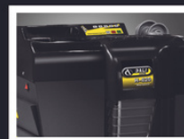
Sleek rugged design