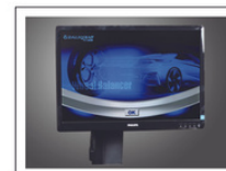
19 inch LCD monitor