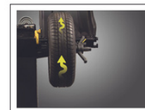
Electromagnetic brake makes braking more efficient