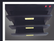
Body with draws for tool storage