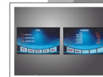
With self-calibration and self-inspection functions