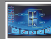
Various balance features. Choose right mode according to specific rim requirements.